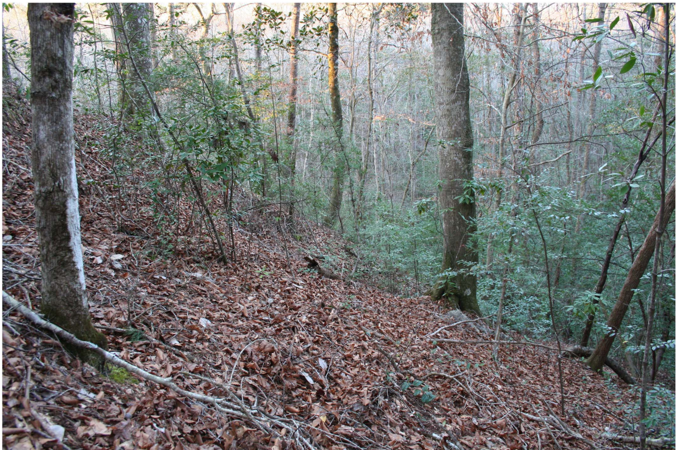
Figure 1. The mesic ravines along the Apalachicola River in northern Florida harbor a variety of rare plant and animal species. 20 th century declines in the formerly dominant endemic conifer Torreya taxifolia have resulted in shifting tree community composition. doi:10.1371/journal.pone.0103933.g001

If fire played a dominant role in the ravines historically, a necessary condition would have been the presence of flammable fuels. Following the logic of Mutch [2], we proposed that if the flammability of historic ravine species is high, then fire may have played a persistent role in ravine plant dynamics. If, however, contemporary fuels are more flammable than historic fuels in T. taxifolia -dominated communities, then this shift would suggest negative fire feedbacks, as described for wet Neotropical forests [12,13,27]. To better understand the role of fire in ravine communities past and present, we evaluated the flammability of ravine species, comparing historic and contemporary tree community composition. Results will help clarify the role and potential effects of fire in the ravine ecosystems and, more broadly, help shed light on the effects of shifting species composition on fire regimes.